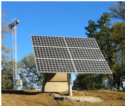
SunWize® Power Ready System in California.

In summary, when you are considering the use of PV as a power source, see if you