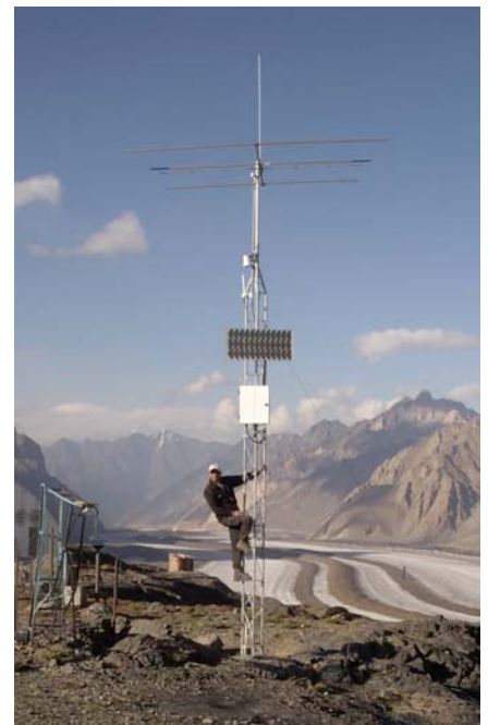
SunWize® Power Ready System in Tajikistan.