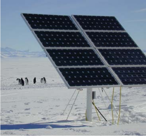
SunWize® Power Ready System in Antarctica.

Can you answer “Yes” to the six questions below?