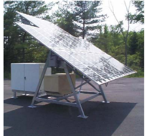
An 1800 watt PV/engine hybrid systems for a US Border Patrol Surveillance site.

If your continuous load is between 300 watts and 2000 watts, you can add PV to your engine generator to create an active PV/engine hybrid system. In a hybrid system each generation source contributes regularly to the load over the course of the year. Often the contribution "mix" is close to 50% each. In areas of high solar radiation, and where the load is