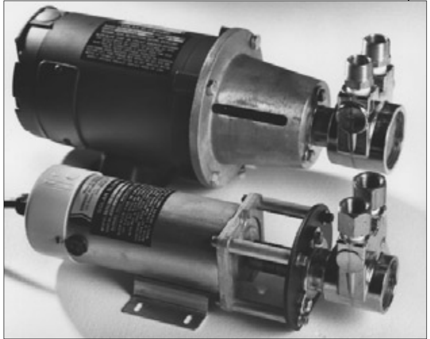
1300 and 2600 Series Solar Slowpumps

Slowpump is less expensive than submersible DC pumps, and made in a much wider range of sizes. Wearing parts typically last 5 to 10 years. Overall life expectancy is 15 to 20 years.