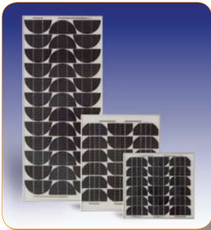
SunWize OEM Series 40W, 20W and 10W.