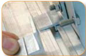
Bottom Mounting Clip Set