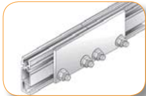
Solar Mount SP2 Plate Splice Kit