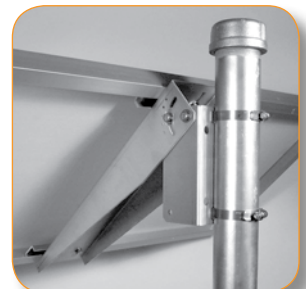
SW Single Module Adjustable SOP Mount