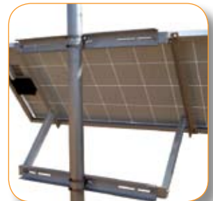
SW Multi-Module Adjustable SOP Mount