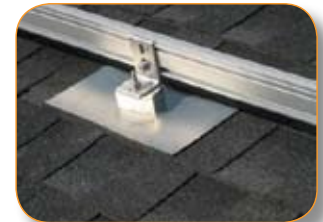
Composition Mount shown with rail