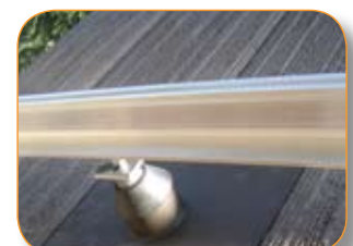
Flat Tile Mount shown with rail