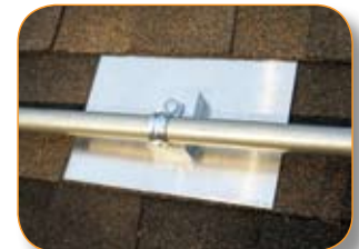
Conduit Mount shown with conduit

Quick Mount PV™ flashings for concrete tile are designed to replace one existing piece of flat (or curved) concrete tile with a combination mount and cast plastic tile flashing. Quick Mount is compatible with Monier, Eagle, Lifetile and Hanson products.