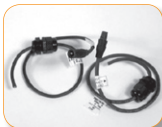
SunWize MC Cable Assemblies