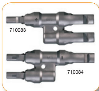
MC 4mm Branch Connectors