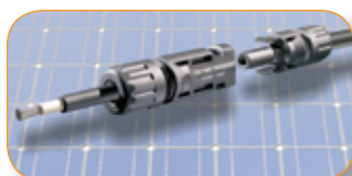
MC Cables 4mm